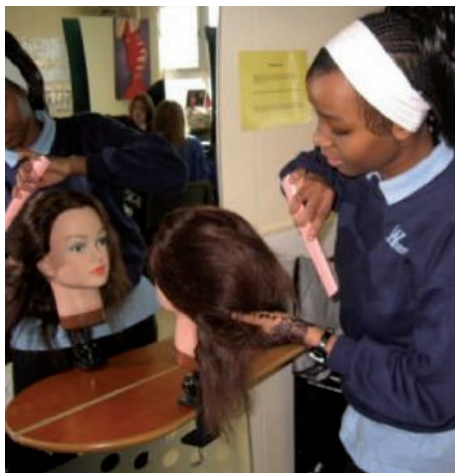
A Weavers student practices on a 'head' used for teaching.

UK Memory Championships at The Northampton Saints