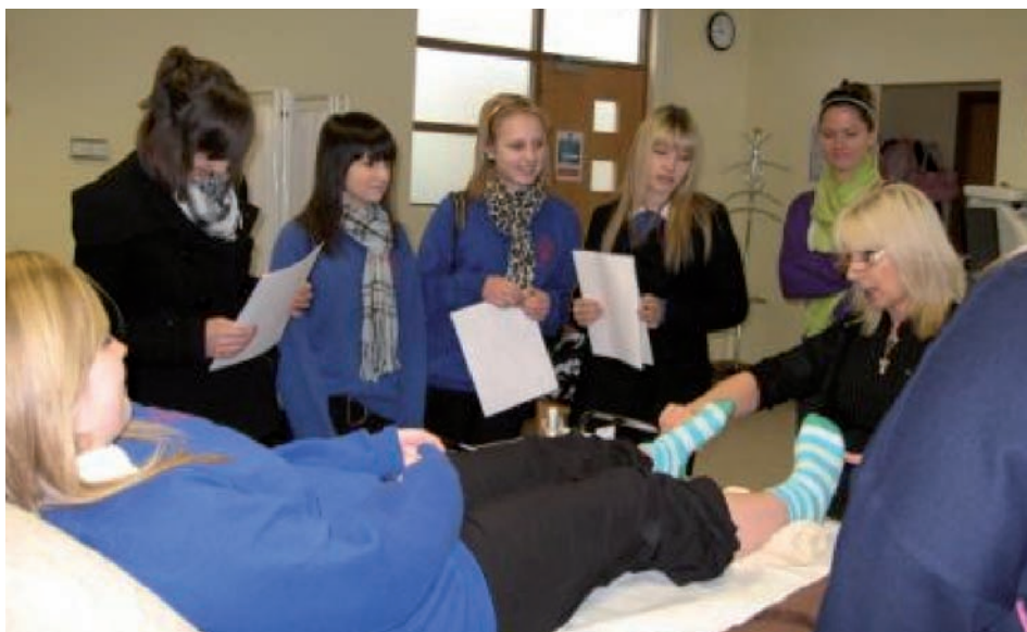
Students observe a massage session.