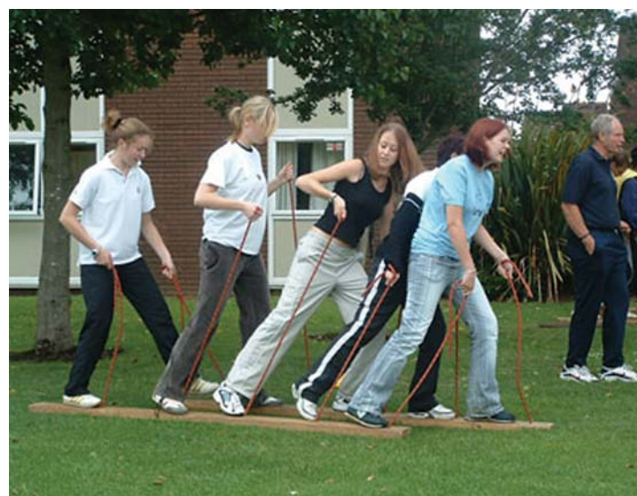
Activities at Summer School are fun and involve students learning to work together.

The following two Summer Schools will both run for two nights each, and are both aimed at year 10 students from Northamptonshire (45 students at each). The first of these summer schools will involve subjects that can be studied traditionally in higher education called 'Bodies, Beats, Buildings and Business'.