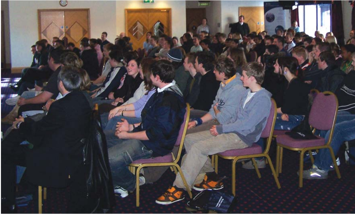
Students at the Vocational and Workbased Learning Conference held on the 23rd February 2005 at Rushden and Diamonds

newsletter newsletter newsletter newsletter